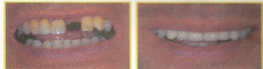
Cosmetic Dentistry Patient (porcelain crowns)