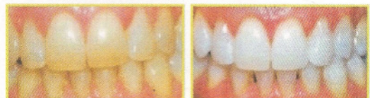
Zoom Professional Tooth Whitening

Creating healthy and beautiful smiles at the best prices! Call us today to receive a free check up and consultation