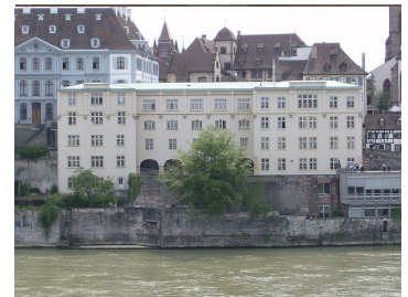
University of Basel

"Incredible, breads, wine and cheese ... the hangovers remain the same..."