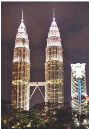
KL Sky line